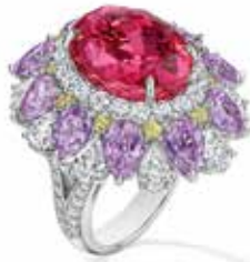
Harry Winston red spinel ring with multi-coloured sapphires and diamonds

These gemstones are spectacular, alluring and paint the fervour of some of the world's most established jewellery houses.