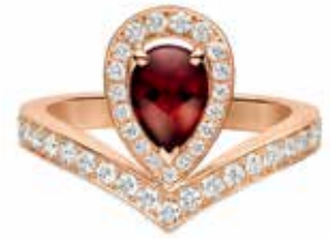
Chaumet Joséphine Aigrette ring in pink gold, set with one pear-shaped pyrope garnet and brilliant-cut diamond

This new setting, made possible by cutting-edge technology and age-old craft skills, has less visible precious metal while letting the set stones do the talking.