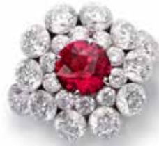
Chopard Magical Setting diamond and ruby ring

Inspired from the archival sketches that date back to the 1950s and 60s, this cocktail ring from the Winston Candy collection showcases the house's passionate dedication to using only the finest stones from around the world.