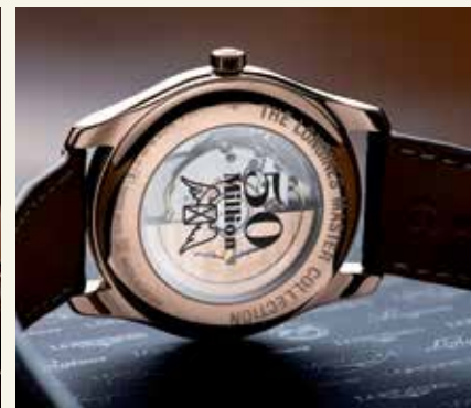
CLOCKWISE FROM TOP: GUCCI, LONGINES (2); CHANEL (3)